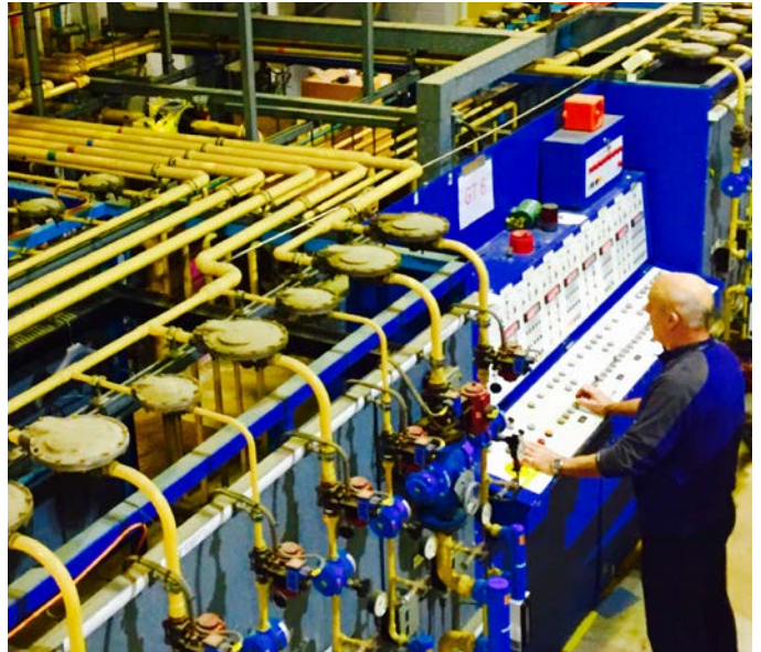
*an additional charge may apply

Clients are welcome to view the testing of their products, to meet with our technical engineers and experience testing first-hand to share with colleagues and technical teams. Plus if you wish to film the testing of your products for promotional or technical purposes, we are happy for you to choose this option*.