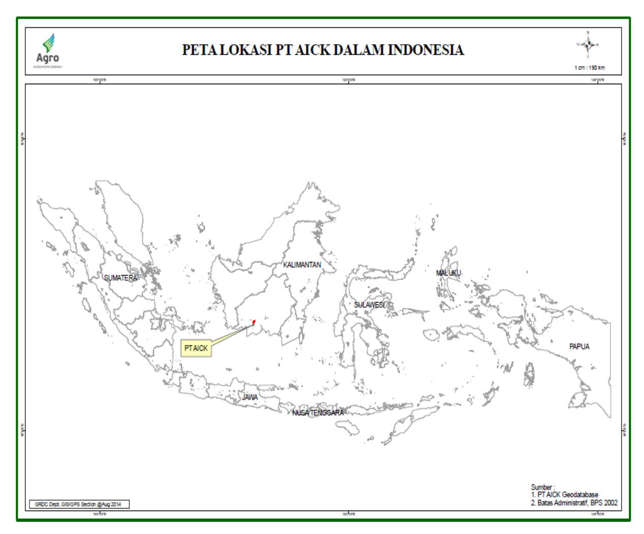
Figure 1. Location Map of PT Agro Indomas, Central Kalimantan