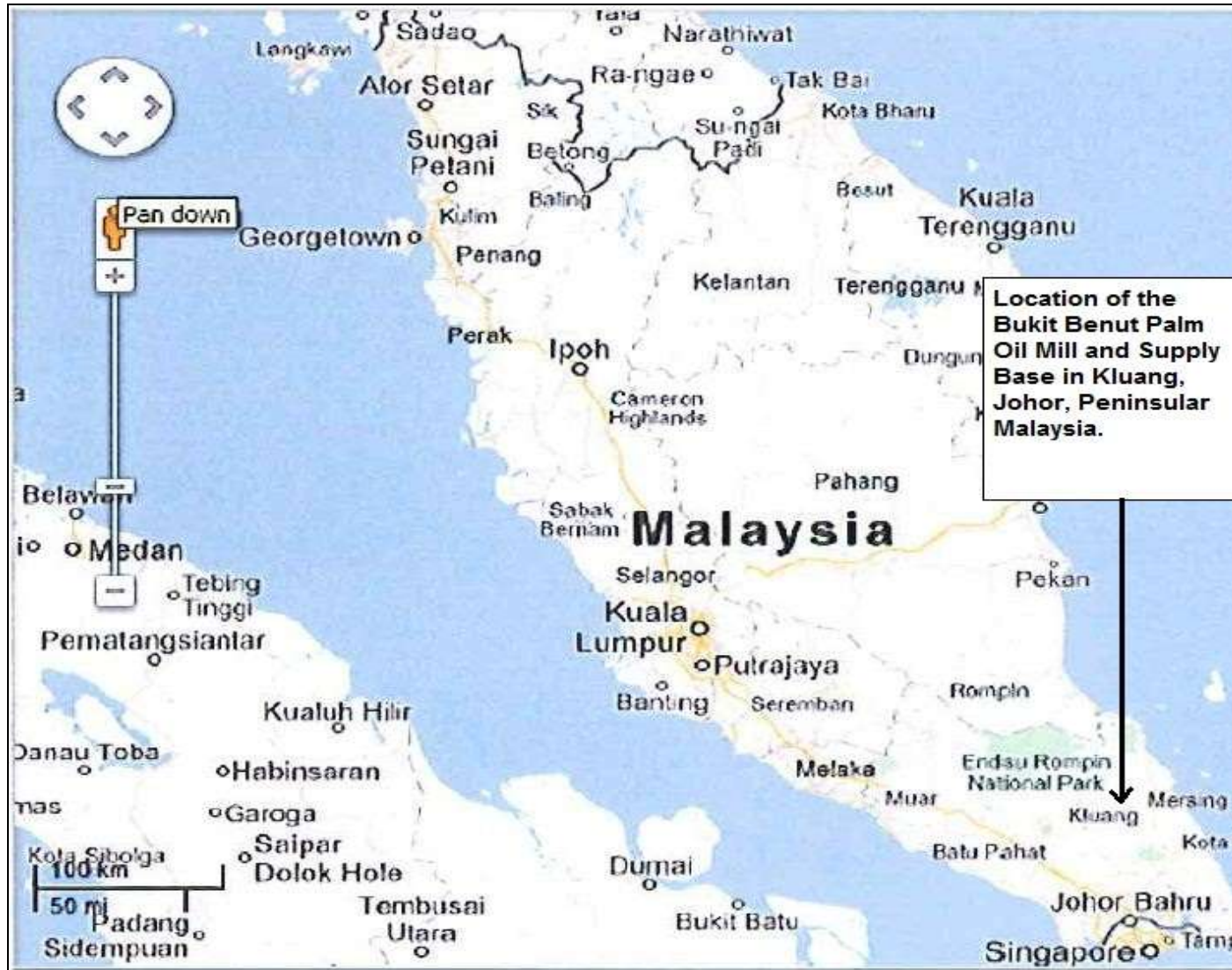
Figure 1: Location of Bukit Benut Certification Unit and Supply base in Kluang, Johor, Malaysia